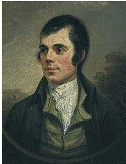
The best-known portrait of Burns, by Alexander Nasmyth , 1787 (detail)

Robert Burns (25 January 1759 – 21 July 1796), also known as Rabbie Burns , the Bard of Ayrshire , Ploughman Poet and various other names and epithets, [nb 1] was a Scottish poet and lyricist. He is widely regarded as the national poet of Scotland and is celebrated worldwide. He is the best known of the poets who have written in the Scots language , although much of his writing is also in English and a light Scots dialect , accessible to an audience beyond Scotland. He also wrote in standard English, and in these writings his political or civil commentary is often at its bluntest. He is regarded as a pioneer of the Romantic movement , and after his death he became a great source of inspiration to the founders of both liberalism and