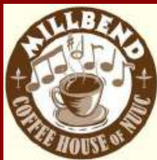
HOSTING LIVE ACOUSTIC MUSIC IN THE WOODLANDS SINCE 1992