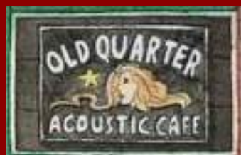
Where Lyrics Still Count

Downtown and Uptown (Post Oak) locations!