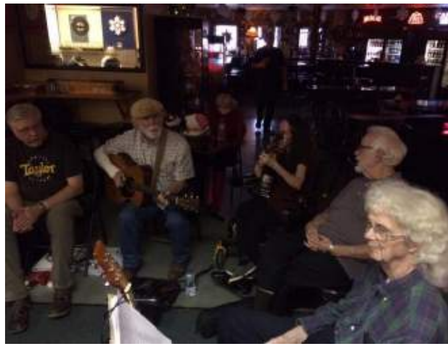
Bitter-sweet farewells, good food, good music and good company! A lovely final Pickin' Party for 2019!