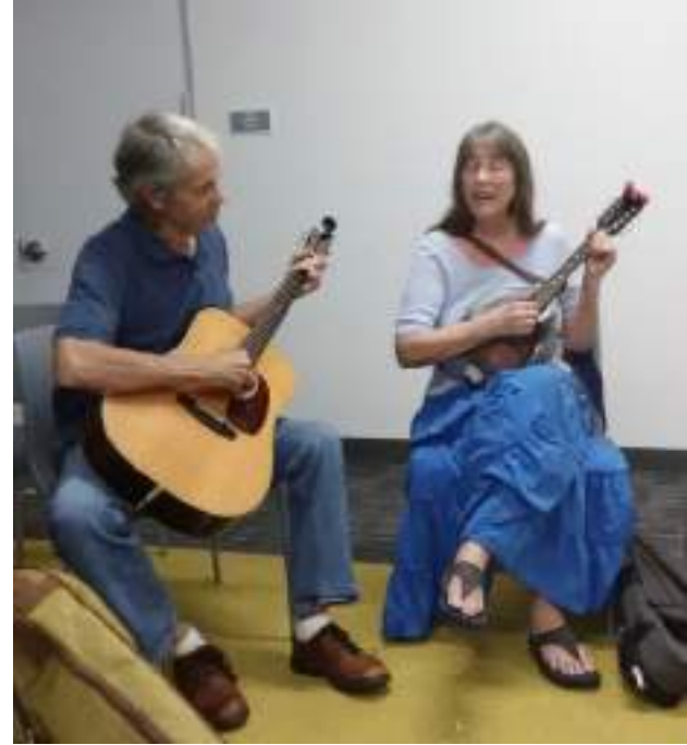
Our first Monday song circle is always relaxed musical fun.