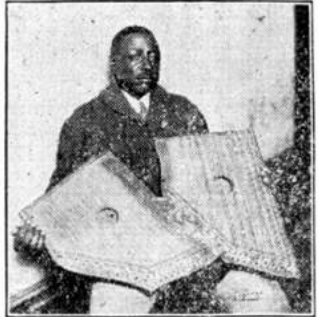
WASHINGTON PHILLIPS Who Will Sing Gospel Records for the Columbia Phonograph Co.

All in all, this is a masterpiece of gospel blues (an oxymoron?), and provides a unique listening experience. It is only wished that more was known about Washington Phillips, minister of musical mystery, and that there was a video of him playing his wonderful-sounding Manzarene.