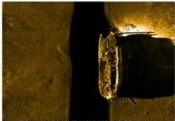
HMS Erebus Remains (Side-Scan Sonar Image)

In 1845 Lord Franklin's expedition set out to explore for a northwest passage through Canada to find a shorter route to the Orient. The expedition included 129 men and two ships, the HMS Erebus and the HMS Terror . They had provisions for a three year voyage. These included food in lead sealed cans. Timing of the voyage was unfortunate because it set forth during of cycle of very harsh winter weather. The expedition was never heard from again. One of the rescue missions discovered a stone cairn in which was found a cylinder with a page from the ship's log. The ships had been stuck in the ice for two years, and Lord Franklin had died in 1847. The log was amended when the captain in charge at that time took his men on foot to the south. Lady Franklin raised funds for several search and rescue missions. A song was composed to spread awareness of this lost expedition. The song " Lady Franklin's Lament "