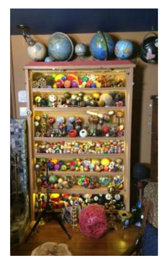
Finally, it was time to "head back to Texas to tell the grand tale.