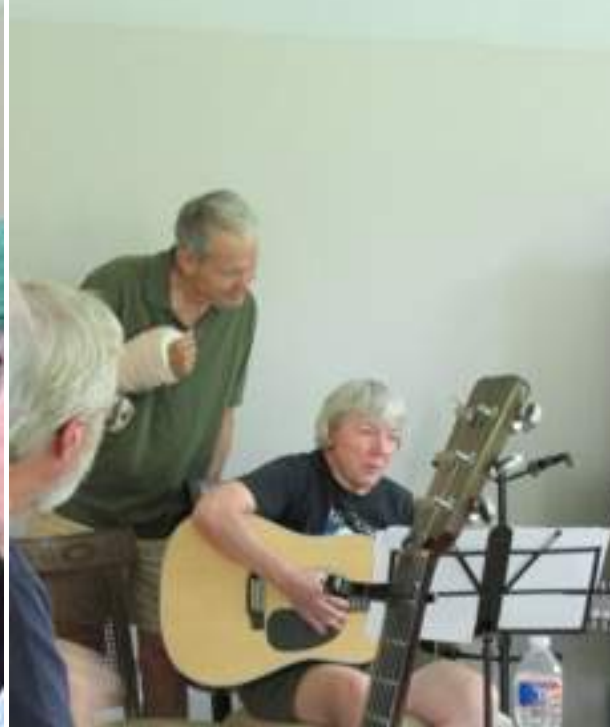
It was another wonderful gathering, continuing the timeless tradition of sharing friendship, music and food.